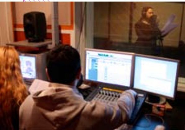
A voice actor records dialogue for “The Way”

The producer says, “Culturally, the show is a little different on the