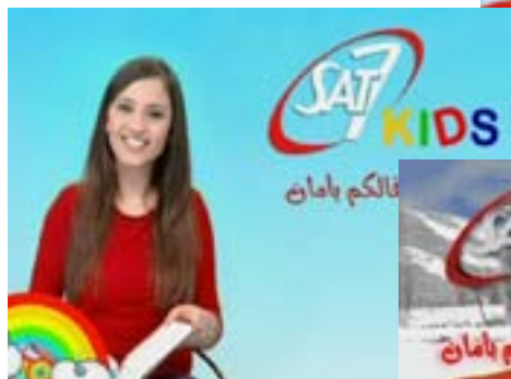
"Where Your Kids are Safe" on-air promos