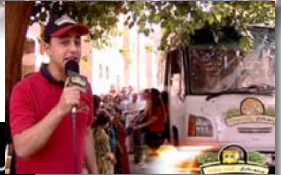
The “Safari Service” bus arrives to bless a village